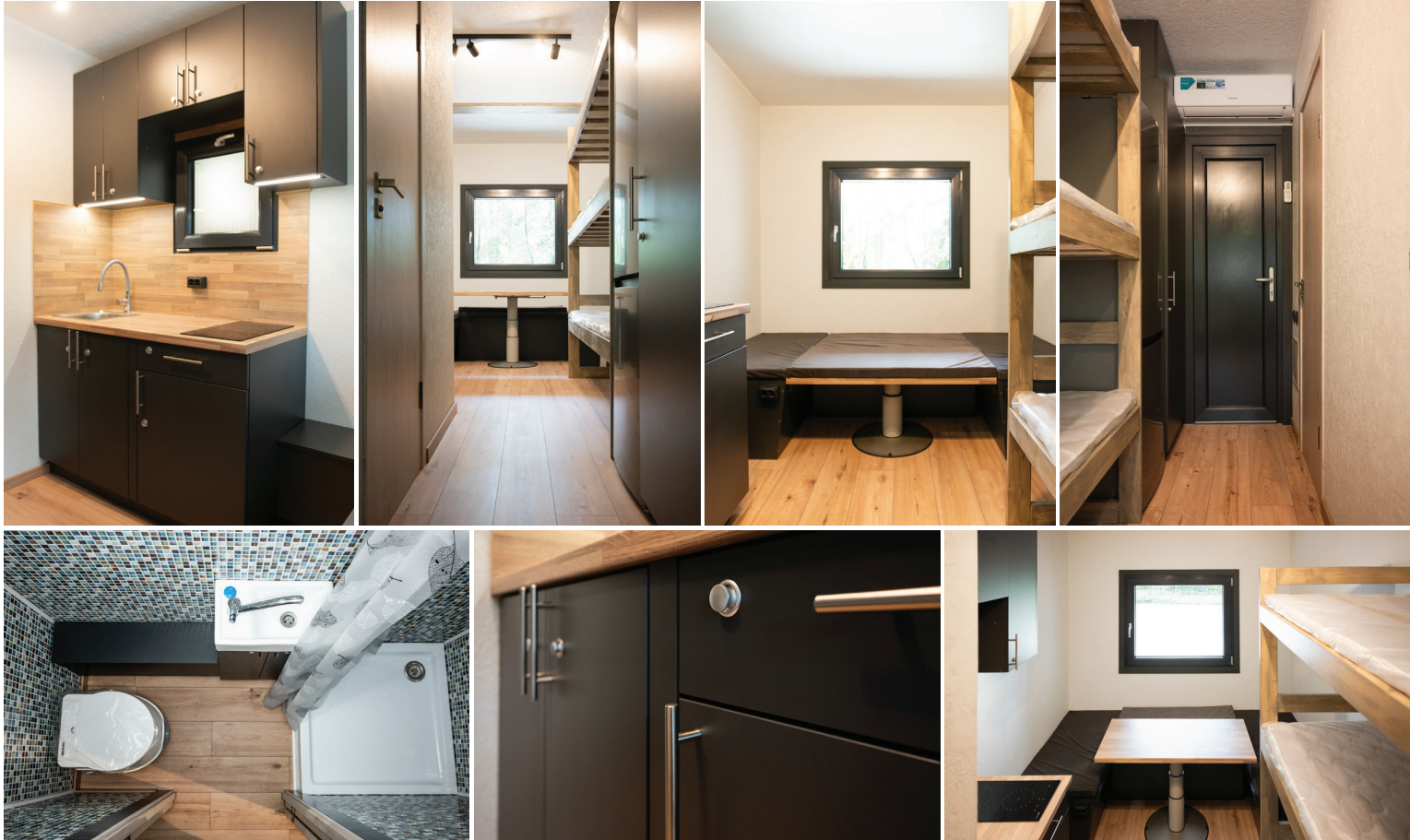
LAYOUT M 1:20